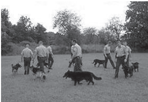
Figure 3. K-9 unit training